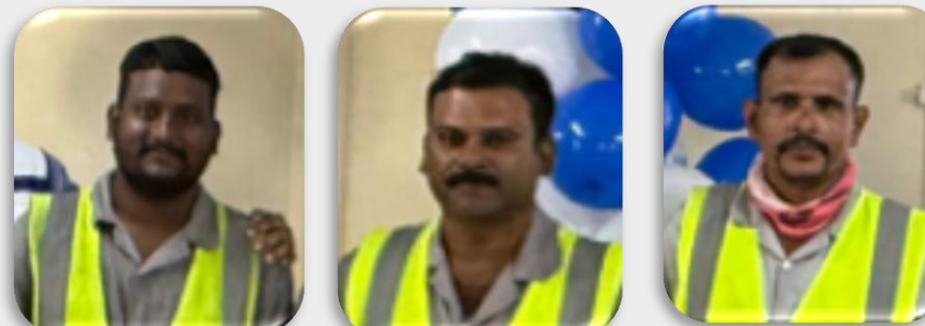
WINNERS – PROJECT PILOT