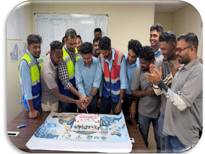
LEM Celebration Cake "World Day for Safety and Health at Work 2026"