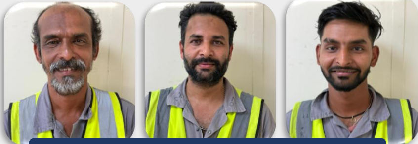
Winners - AL-DEEM DEVELOPMENT