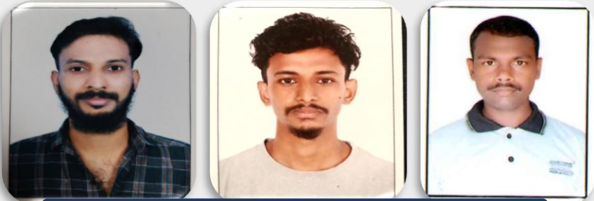
Winners - AL-RAHBAH