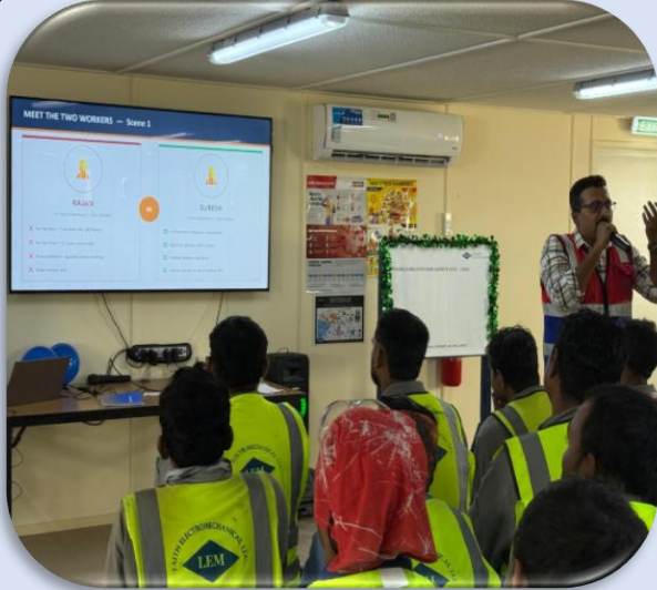
Safety Awareness Presentation